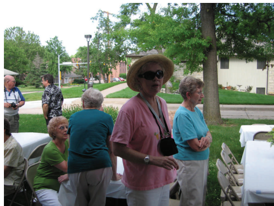
Waiting for fried chicken