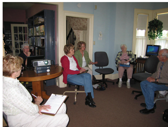
Ancestry.com Webinar at the library — always something to learn